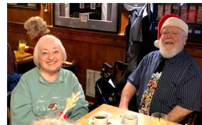
"Santa" delivers beautiful hand-made cards to everyone.