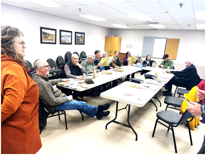
BCGREA Members and reps from the North Cariboo Agricultural Marketing braved a snowstorm on Feb 18!