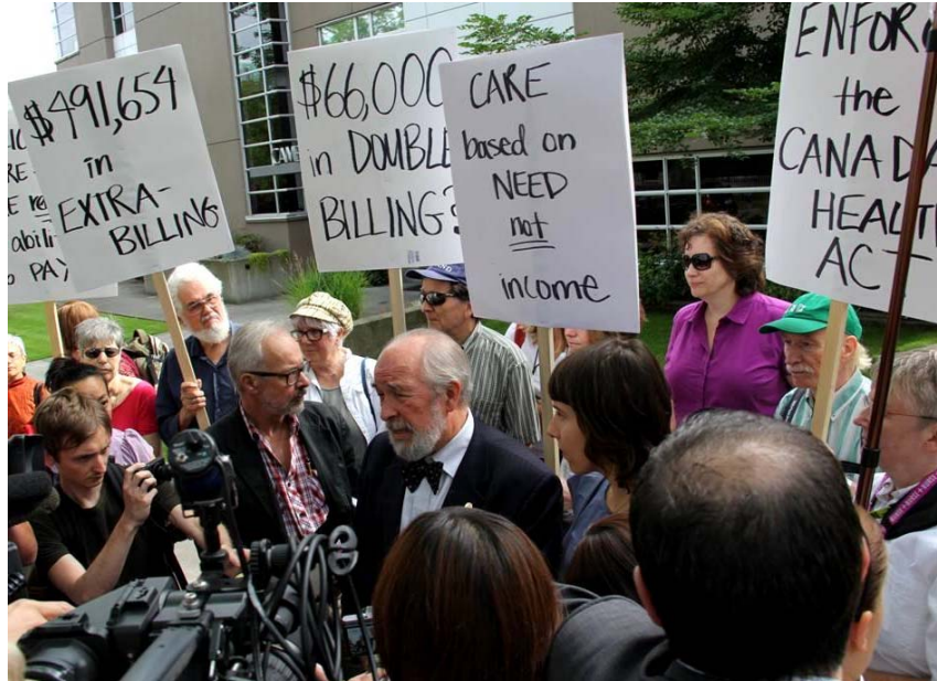
Action outside Cambie Surgery Centre

Research shows that private clinics actually increase wait times overall because scarce health care professionals can't be in two places at once.