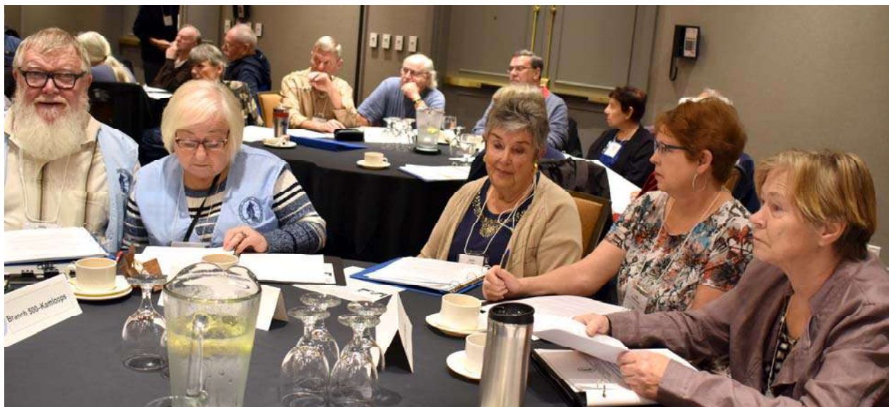
Branch 2500 Peninsular and Gulf Island and Branch 500 Kamloops